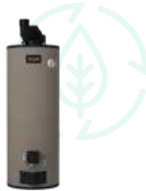
Power Direct (50 gal)