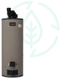
Power Direct (40 gal)

ENERGY STAR® certified water heaters are an easy choice for energy savings, performance, and reliability. They use less energy than standard models, saving you money on your utility bills while helping protect the climate.