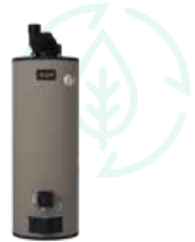
Power Direct (50 gal)